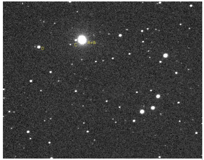
Figure 2: CCD image of STF2486, 10 s exposure.

fitting of Astrometrica but produces consistent results with better than 1/2 pixel accuracy for correctly exposed stars. For close stars I use AIP4WIN's "Resample" function to enlarge the image 10 times to 1000% and then measure distance and angle with the "Distance Tool" function. For the focal length I provide